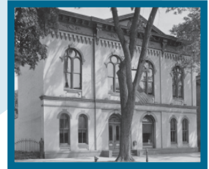
Former Historical Society Building Union Street, Next to the Stockade Inn

1905 2005 1905 2005 1905 2005 1905 2005 1905 2005