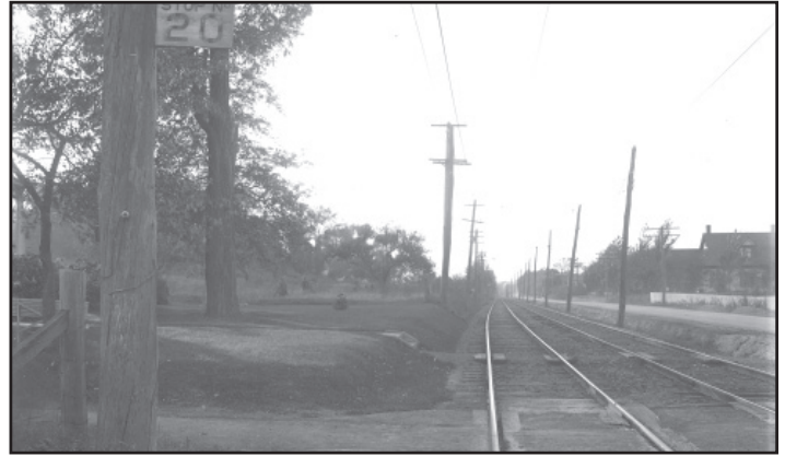
Scene along the trolley lines at Stop No. 20. The picture was made from a glass plate negative. Do you know where Stop No. 20 was?