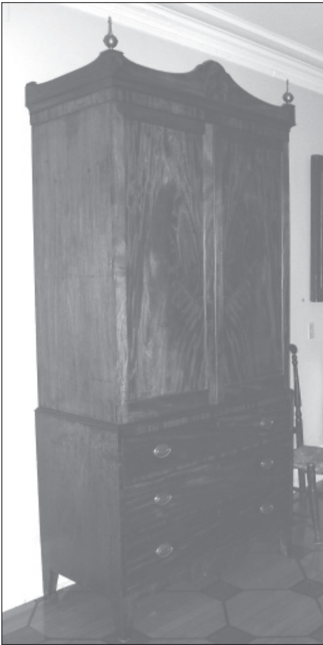
LINEN PRESS New York circa 1790-1800 Mahogany, pine secondary wood

Recently restored, this piece served as a storage unit for clothes and linens. It shows Federal period styling with its splayed front legs, shaped apron at base, crest with brass finials