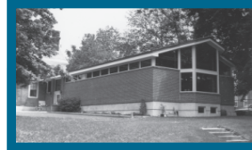
Greenes Doolittle Library