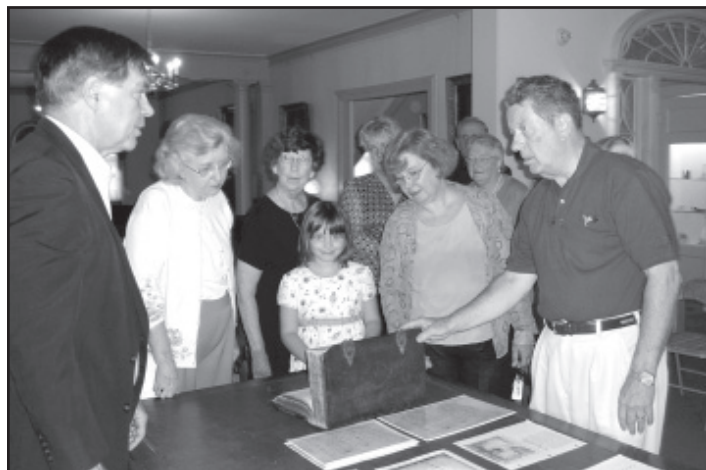
Members of family at presentation