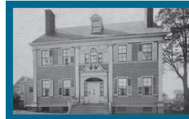
The Historical Society, 32 Washington Avenue