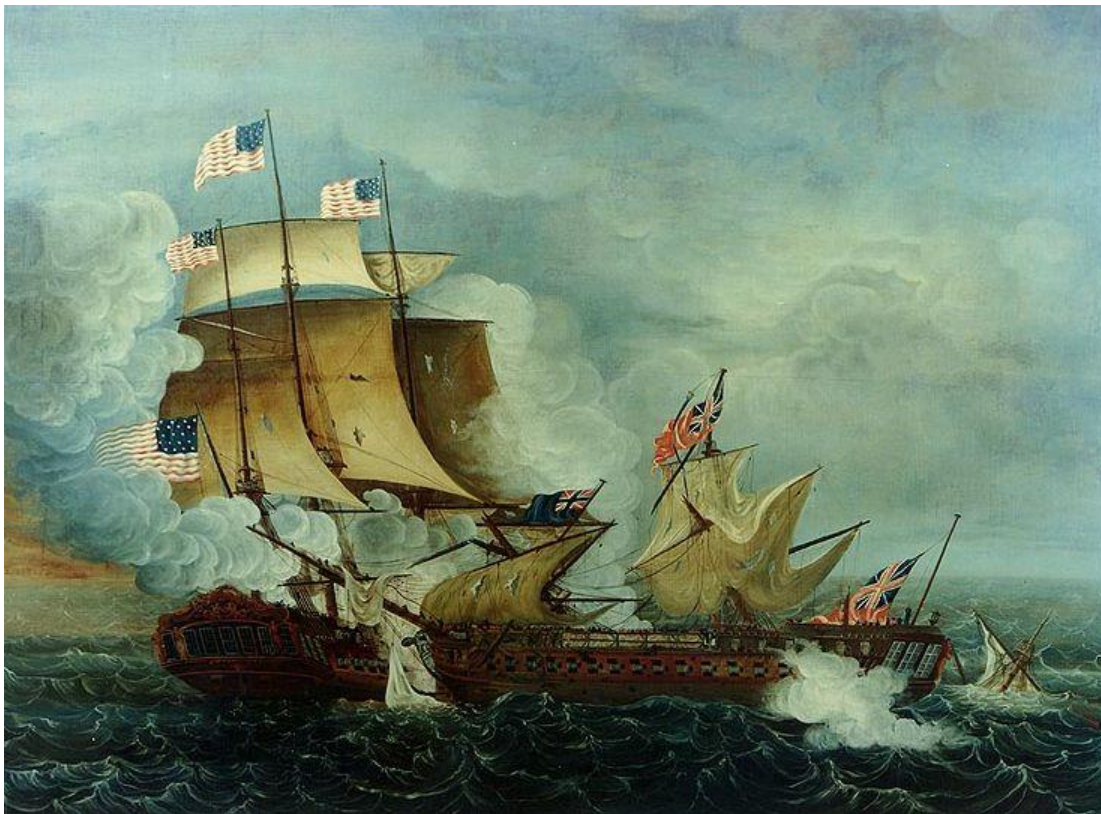
Painting by Thomas Birch

Mabee Farm Historic Site 1080 Main St Rotterdam Jct., NY 12150 (518) 887-5073