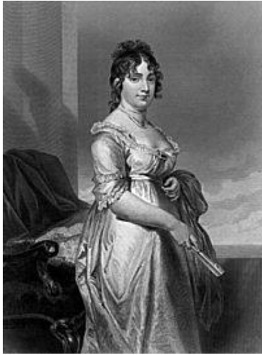
First Lady Dolley Payne Todd Madison

The War of 1812 began on June 18, 1812, when President Madison signed a declaration of war which began: “ Be it enacted by the Senate and House of Representatives of the United States of America in Congress assembled, That war be and is hereby declared to exist between the United Kingdom of Great Britain and Ireland and the dependencies thereof, and the United States of America and their territories. ”