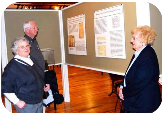
Reading, 'Riting, 'Rithmetic Exhibit at the George E. Franchere Education Center.