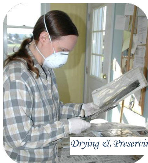
Drying & Preserving Rotterdam Junction history.