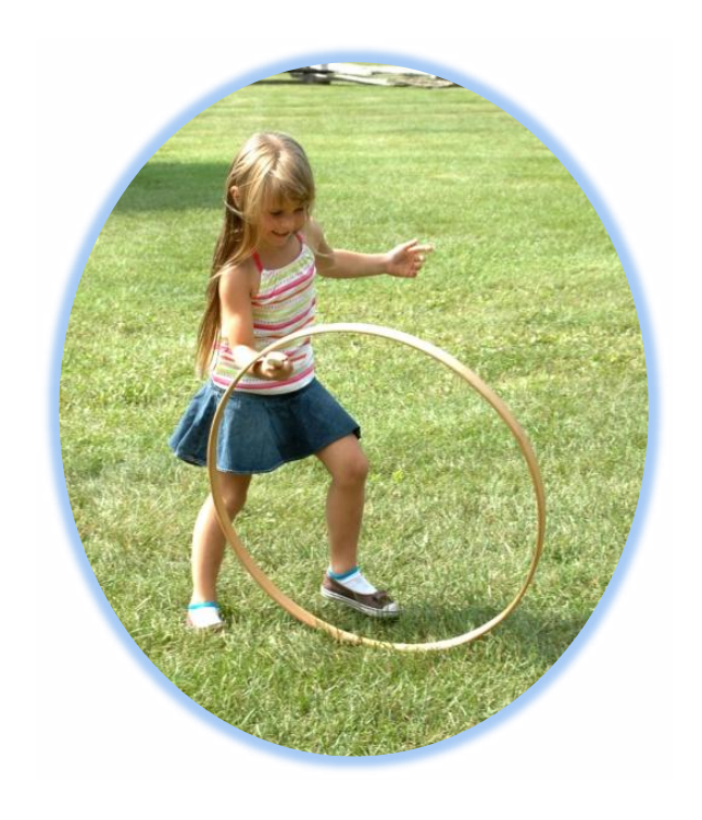
War of 1812 Muster at the Mabee Farm