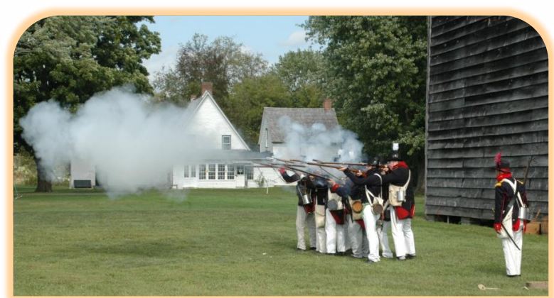
Farm & Foliage Day at the Mabee Farm