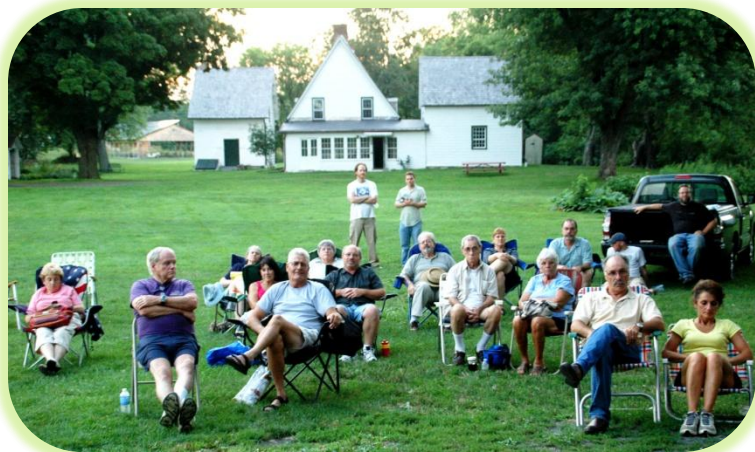
Howlin' at the Moon with Everest Rising at the Mabee Farm