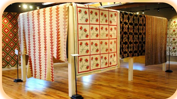
Quilt Exhibit at the Franchere Education Center