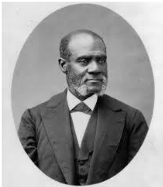
Rev. Henry Highland Garnet

County committees were directed to present relevant petitions to the state legislature as well as to the Convention’s Central Committee, which was then chaired by the Rev. Henry Highland Garnet. Garnet, the son of a fugitive slave, had attended New York’s African Free School, worked as a cabin boy on ships travelling back and forth to Cuba, and received theological training. He moved to Troy to teach school in 1839 and became pastor of the integrated Liberty Street Presby-