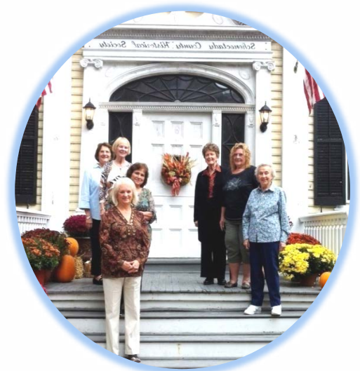
Hugh Platt Garden Club