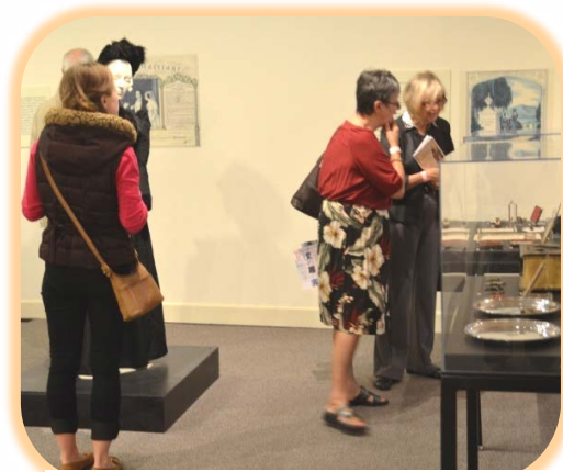
Viewing 'Underlying Structures' display.