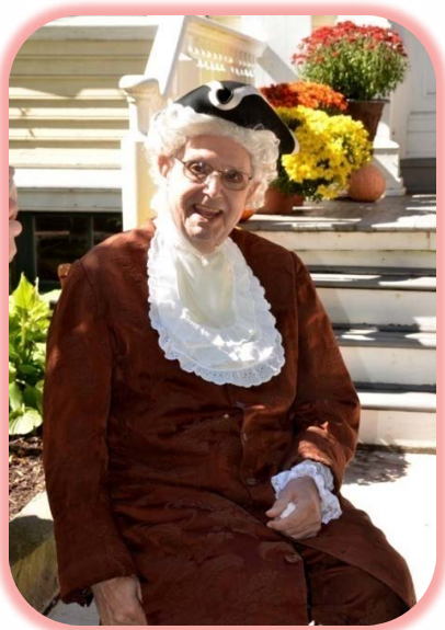
Frank Taormina a.k.a. Governor Yates