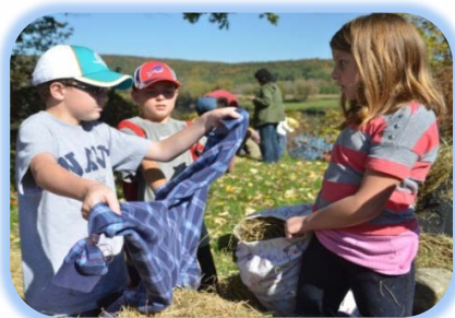
Creating a scarecrow.