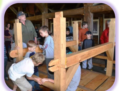
Building a barn.