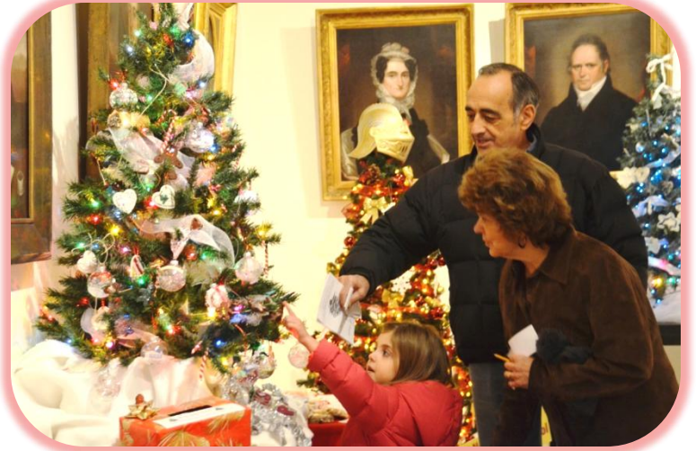
Festival of Trees 2013