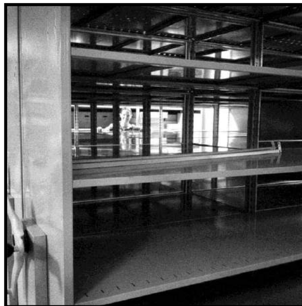
SCHS Librarian/Archivist Melissa Tacke smiles across empty shelves after the installation.

Mobile compact shelving consists of shelving that is mounted on wheeled carriages that travel on rails mounted on the floor. With mobile compact shelving, fixed aisles are not required between every stack; the stacks can be compressed into a smaller space and a single aisle is created as needed by rolling the stacks apart to access a specific section. The shelving, which had been used for document storage by Legere Restorations, was donated to SCHS in September and installed by them at cost. The Library has sorely needed mobile compact shelving for our archival storage area for many years, but the cost of such shelving was far out of our reach. To have it donated to us is truly a dream come true, one for which we are very thankful to our donor, Legere Restorations. —MT