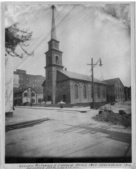
The original Second Reformed Church at the corner of Jay and Liberty Streets, 1856-1909