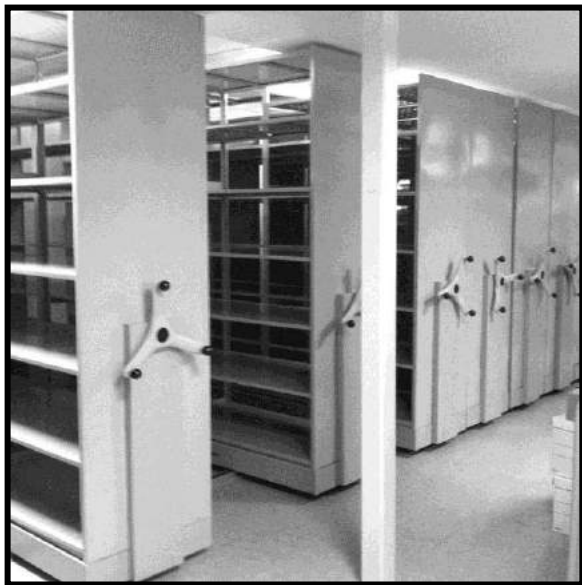
View of mobile compact shelving from center aisle

The Grems-Doolittle Library has received a donation of mobile compact shelving from Legere Restorations of Schenectady. The shelving has a maximum storage capacity of over 1,500 cubic feet.