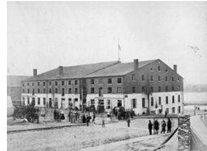
Libby Prison, Richmond, Virginia