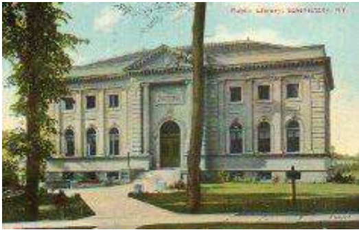
Schenectady's first Public Library, built in 1903 with funds from Andrew Carnegie and General Electric.

By 1958, the Historical Society had been in existence for 53 years. From inception in 1905 to 1912, its HQ was in the Public Library, a "Carnegie library" at the northeast corner of Union Street and Seward Place which is now a dormitory of Union College.