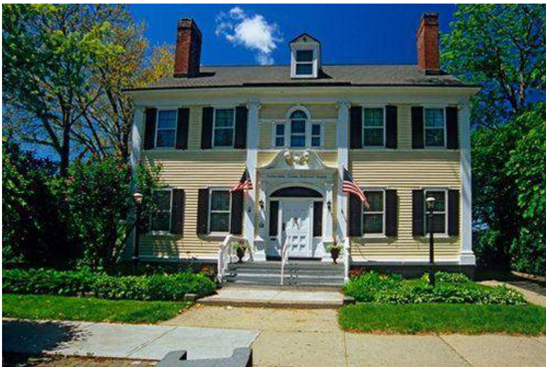
The Dora Mumford Jackson House, the current headquarters of the Historical Society

Mabee Farm: (518) 887-5073 FAX: (518) 887-5746