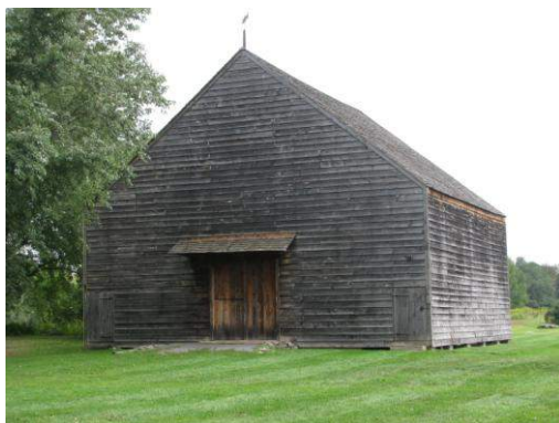
The Nilsen Barn at the Mabee Farm