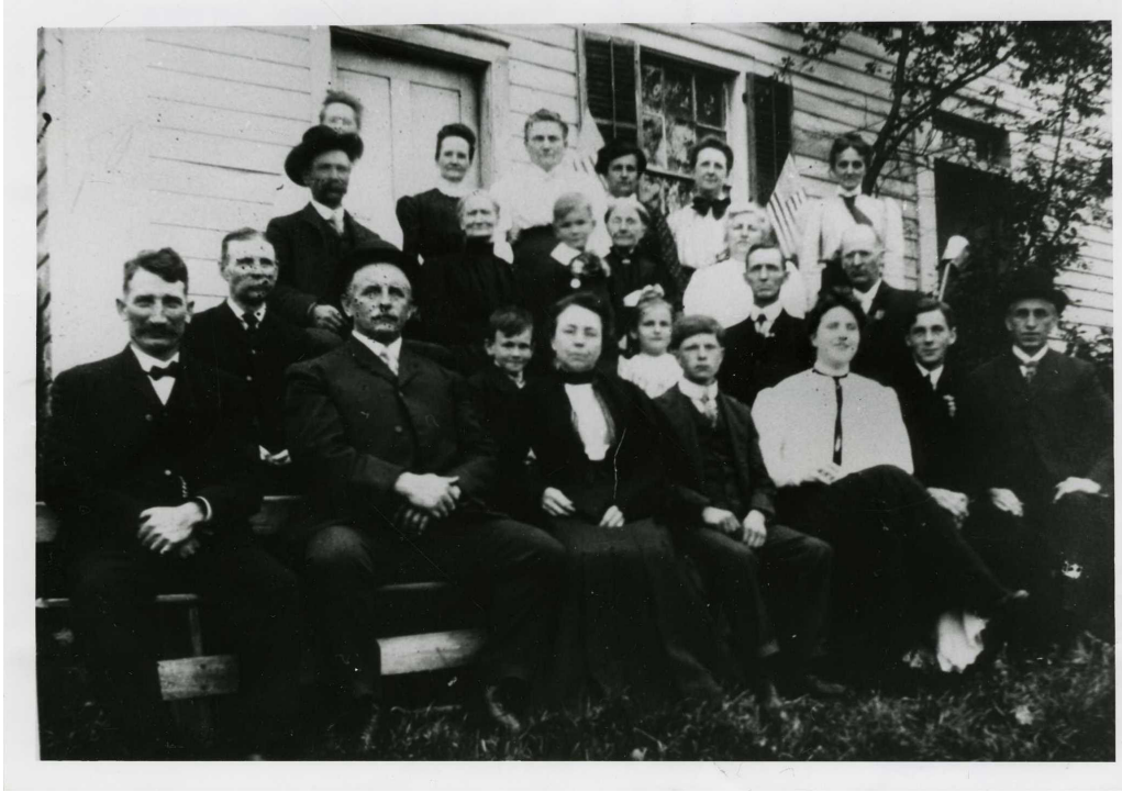
Above: This Gregg-Kline family photo from the SCHS archives shows a 1905 reunion on the grounds of the Plotterskill Farm.