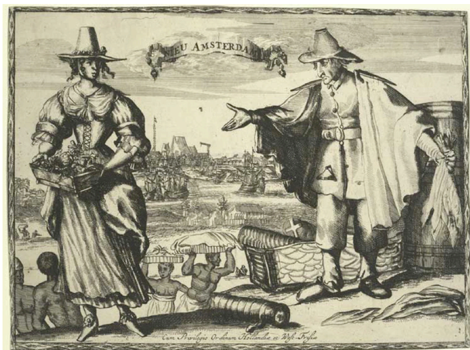
This engraving, a propaganda piece to encourage the settlement in New Amsterdam, is the only known illustration of blacks in that colony.

The exhibition is part of a larger series, featuring lectures, continuing from January to May in the Franchere Education Center at Mabee Farm Historic Site. We are grateful for the opportunity to display this exhibition and bring in lecturers, as we engage people in this often forgotten, but important history.