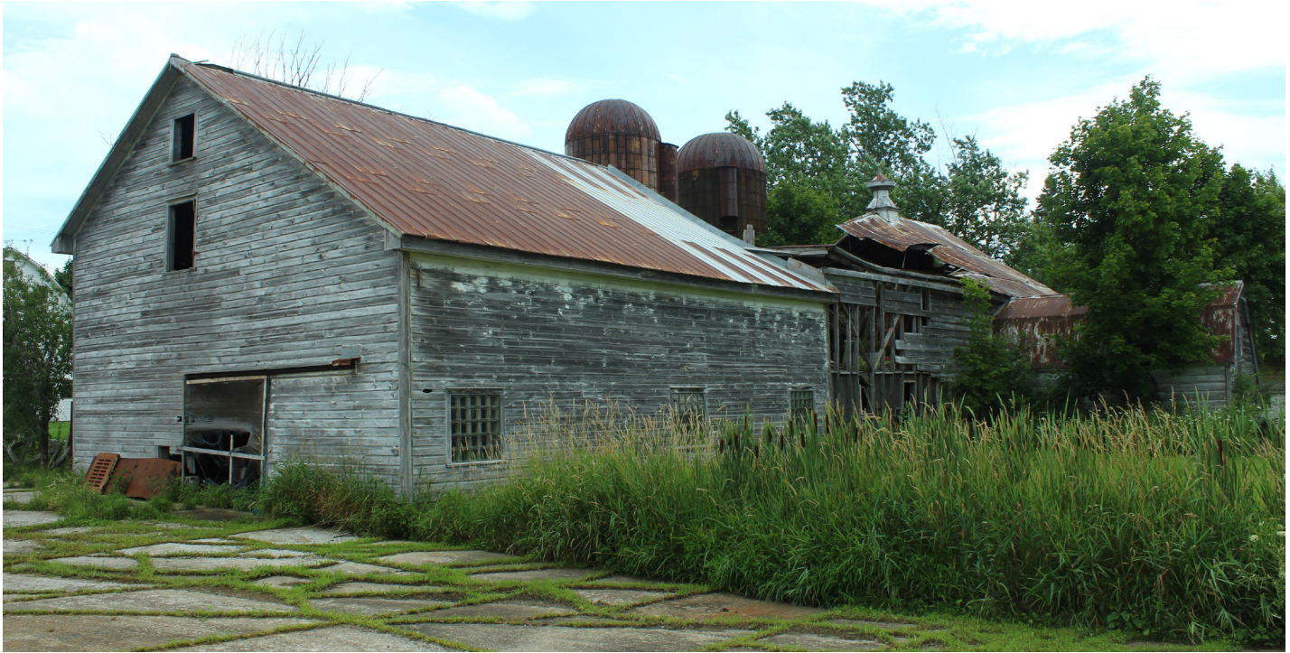
Above: Though tall grass and a crumbling roof dominate the foreground, the fields behind the Plotterskill Farm's barn were neatly mowed in late summer. Front: A recent photograph of the Pine Grove Farm.