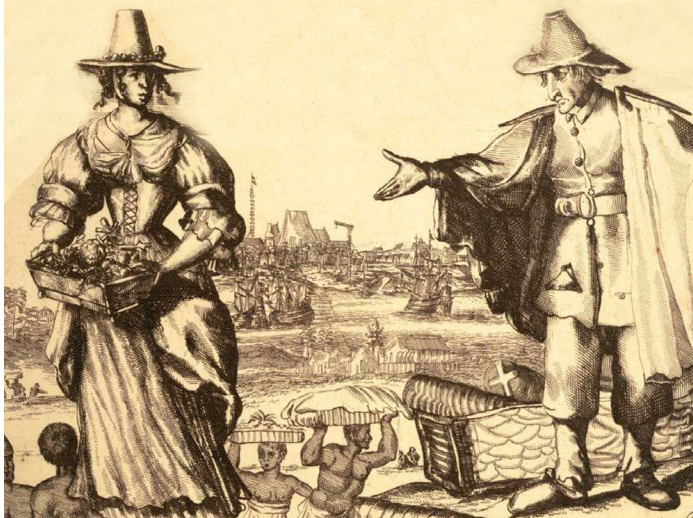
exhibit and lectures at the Mabee Farm Historic Site January - May 2019