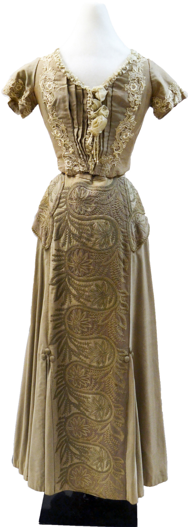
Image: Woman's Day Dress, SCHS Collection, c. 1901. Tailored jackets, long floor length skirts, and high heel ankle boots were typical of the Edwardian period. The focus was on modesty, usually covering the body from the neck down to the floor.