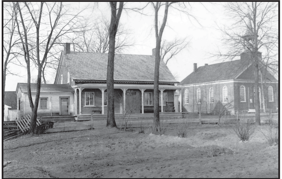
Can you identify this lovely brick church? House next door may be the parsonage.