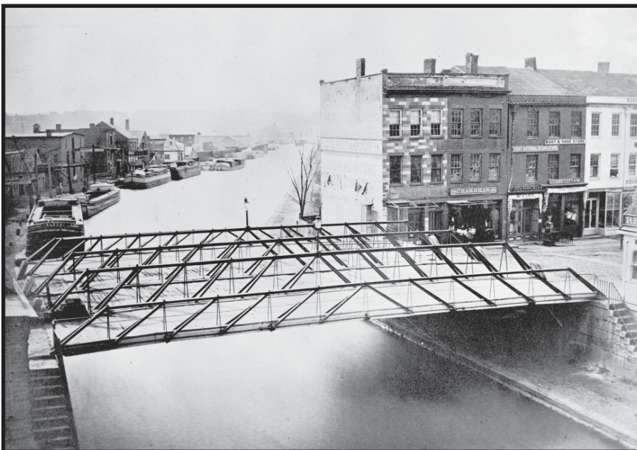
Dock Street (now Erie Blvd.) looking south from the roof of Clute Brothers machine shop about 1886. This is the second bridge at this site. It was erected after the 1841 expansion of the Erie Canal. Note the two whale oil lamps on the bridge center.

All books mailed outside the Schenectady area will receive free postage. Please give us your name, address and email address, if you have one. You will be contacted for payment when the books are here. Books may also be purchased at the Society headquarters or at the Mabee Farm when they are ready.