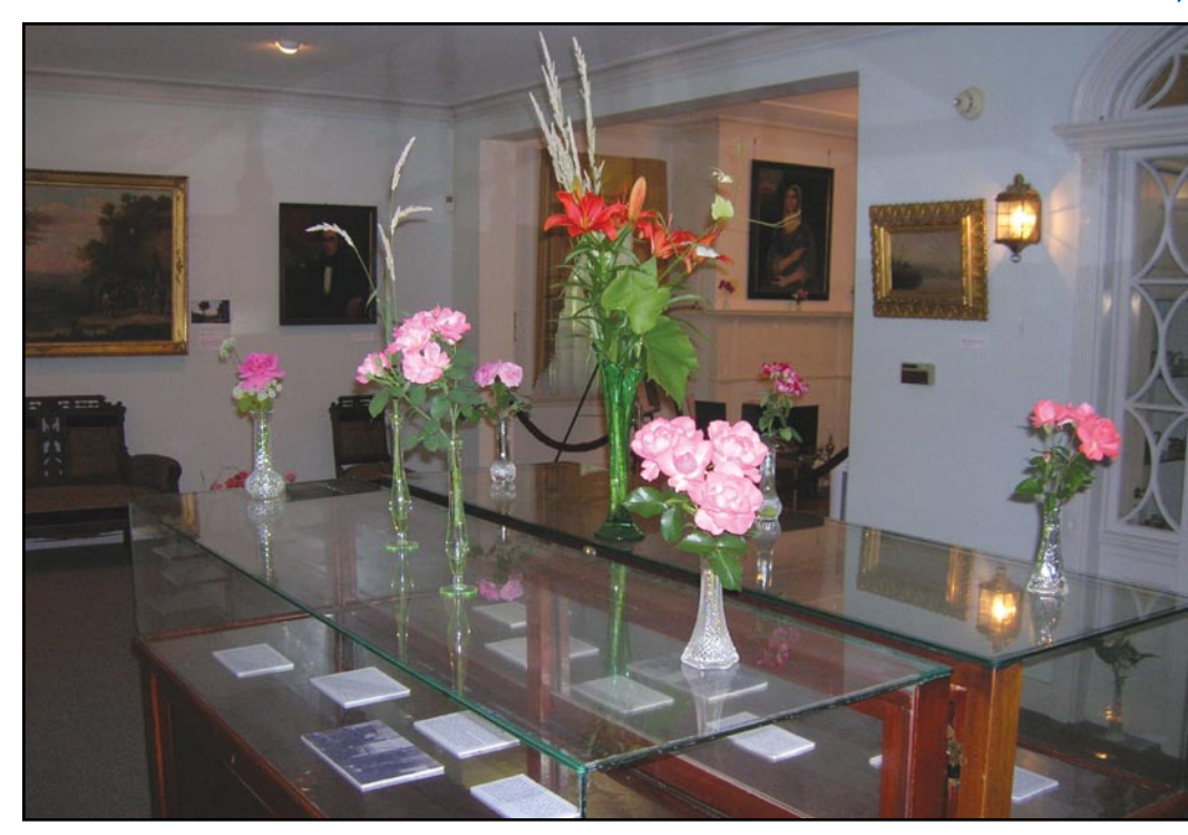
The Vrooman Room on June 23, 2007