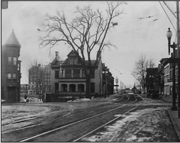
Westinghouse home, State St. c. 1895.