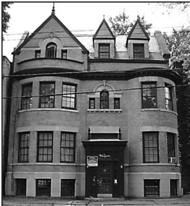
The Westinghouse, 234-236 Union St.

Westinghouse had a unique and valued relationship with his workers. While Andrew Carnegie and Henry Frick were hiring Pinkerton guards to shoot at striking workers at their plants just blocks from those of George Westinghouse, workers at his plants continued in full production fully loyal to their chief.