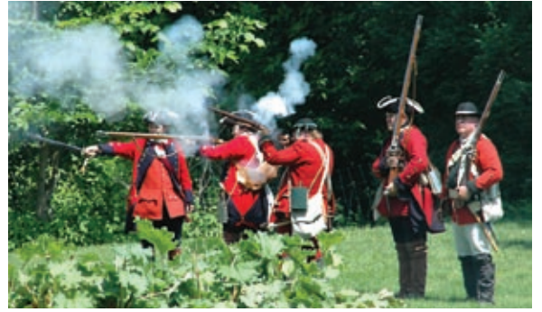
French and Indian War Re-enactment At Mabee Farm June 6-7