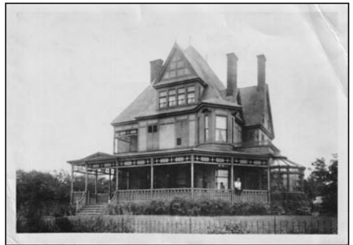
Built to be a home for Westinghouse’s mother, but now the Bond Funeral Home.

The Westinghouse triumph over Edison in the often ugly “war of the currents” was a dramatic distraction from the real story—it was alternating current (AC) that made it possible to light America from coast to coast! If we had waited for direct current (DC) to do that, I might still be waiting for electric lights and other household appliances to this day. His foresight and commitment to research and development led him to purchase exclusive rights to Nikola Tesla’s AC motor patents in 1888. It was a daring risk because of the huge developmental work still required to make the motors adaptable to commercial use. Tesla, the famous electrical visionary, was quoted as saying that George Westinghouse, Jr. was the “only man alive who could go up against Edison and win,” thereby bringing Tesla’s astounding electrical achievements to the benefit of mankind.