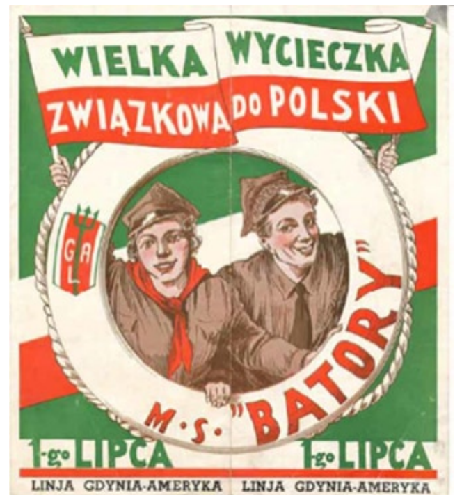
Flier - Polish National Alliance's Grand Tour of Poland for Scouts.