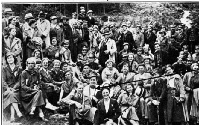
Scout Tour in Zakopane