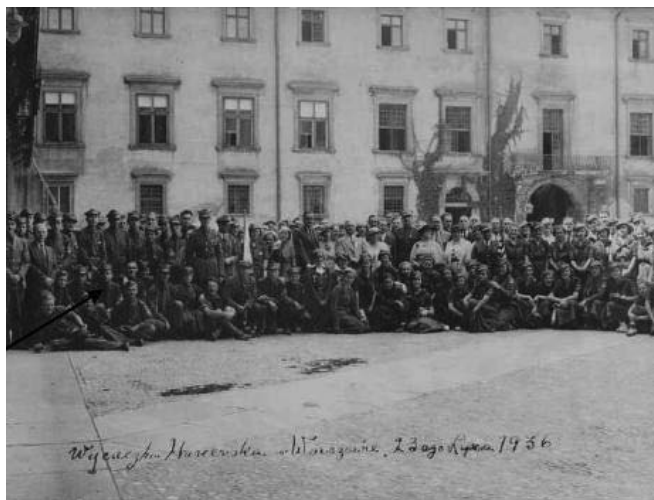
Scout Trip in Warsaw, July 23, 1936

When I got home, browsing the internet led me to the e-TARG website, www.etarg.org . There I found information on the history of the general Nowy Targ area, and a host of people who were also searching for information on relatives from that area. I posted the surnames I was researching and read the entries of others, but made no progress.