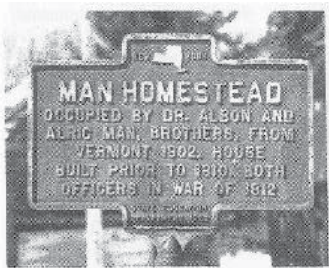
New York State historical marker in front of Man house near Constable, NY