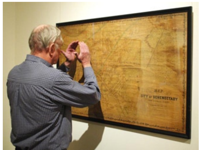
Museum exhibit: The Art in Cartography.