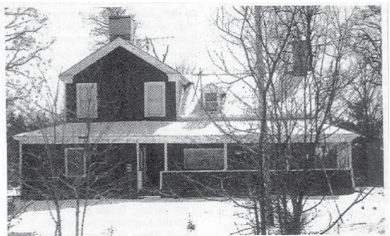
Man Homestead, Westville Corners, near Constable NY.