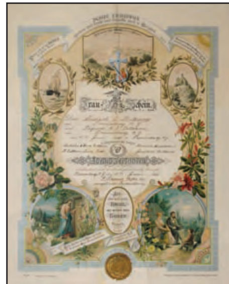
Original wedding certificate.