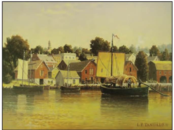
Schenectady Harbor 1814 by Len Tantillo

There are 100 items (three examples are shown) in this online catalog which represent most of what we sell.