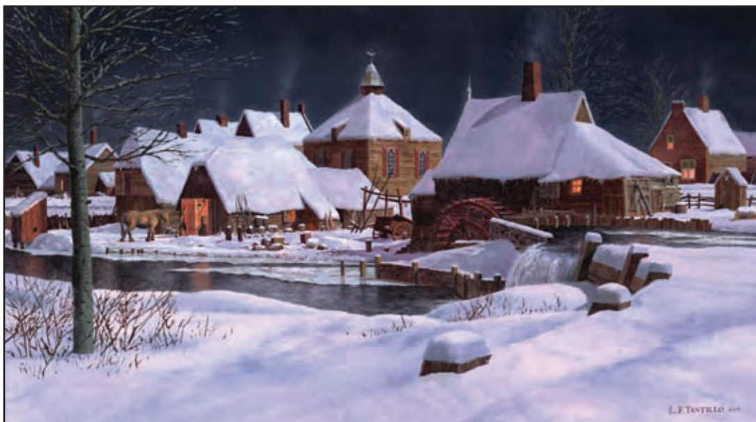
Schenectady Town early on February 8 th 1690 by Len Tantillo