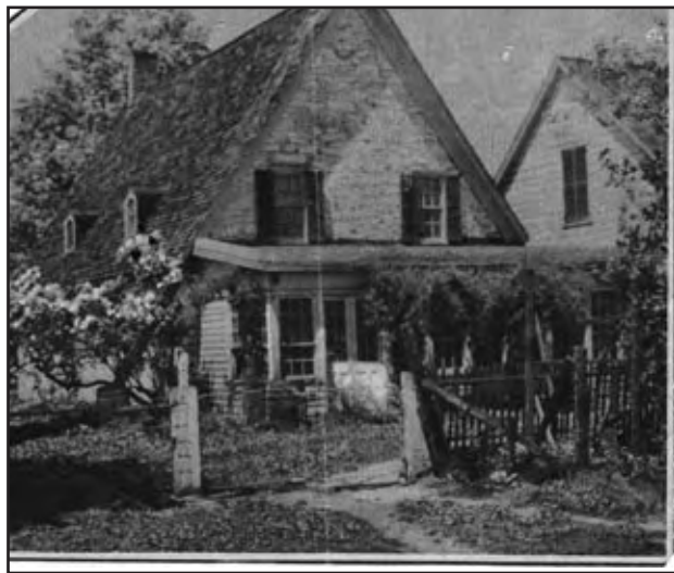
Mabee Farm circa 1930s

Please call (518) 887-5073 for more information.