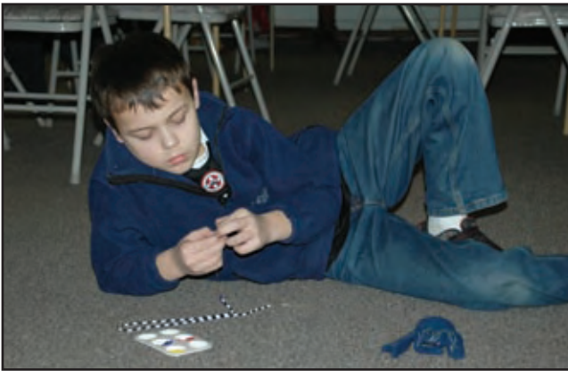
A Schenectady Christian School fourth grader makes a necklace with reproduction trade beads.

Non-Profit Org. US POSTAGE PAID Permit No. 942 Schenectady, NY