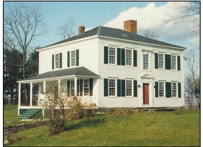
The North Mansion today, Duanesburg, NY