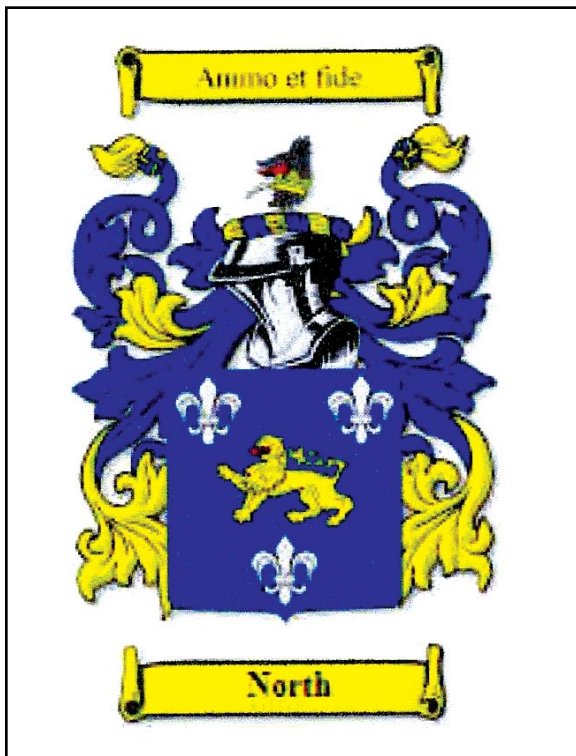
North Family Coat of Arms