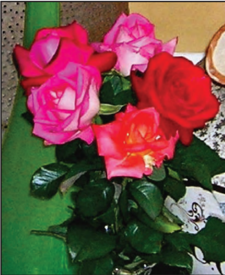
Roses on Display - from lecture on April 12