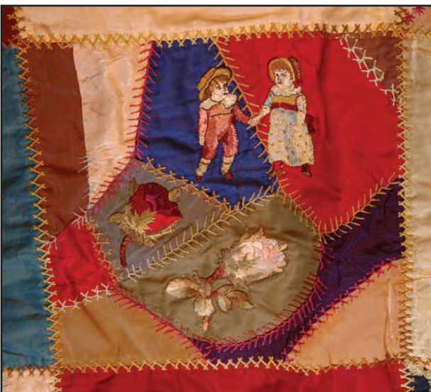
Sections from Crazy Quilts in SCHS collection on exhibit during May & June