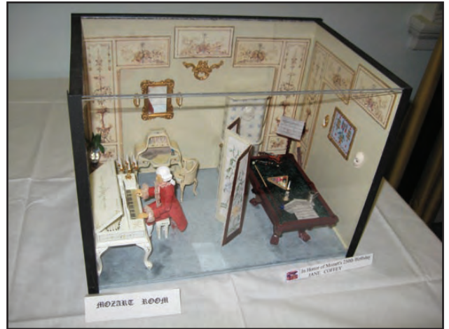
Mozart dollhouse - an example of a box dollhouse - from lecture on march 8