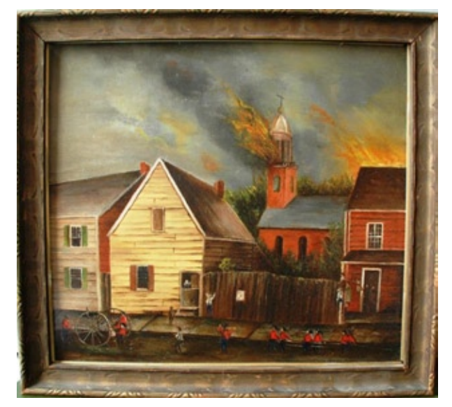
Painting of Dutch Reformed Church on fire in 1861

1819 Fire The City of Schenectady is no stranger to fires. Every school child learns of the destruction of the fledgling village in February 1690 at the hands of the French and their Huron allies. And many know the story of the Great Fire of 1819 which started in a currying shop on Water Street, was spread by strong winds in a northeastern direction, and ultimately destroyed most of the buildings in the 18th century city west of Church Street from Water Street to the Mohawk River. But the Fire of 1861 marks a turning point in fire containment as the city's hose and ladder companies, assisted by fire crews and equipment from Albany, Troy, and Amsterdam, were able to stop the spread of the fire despite the incidence of sparks and embers landing on roofs throughout the city.