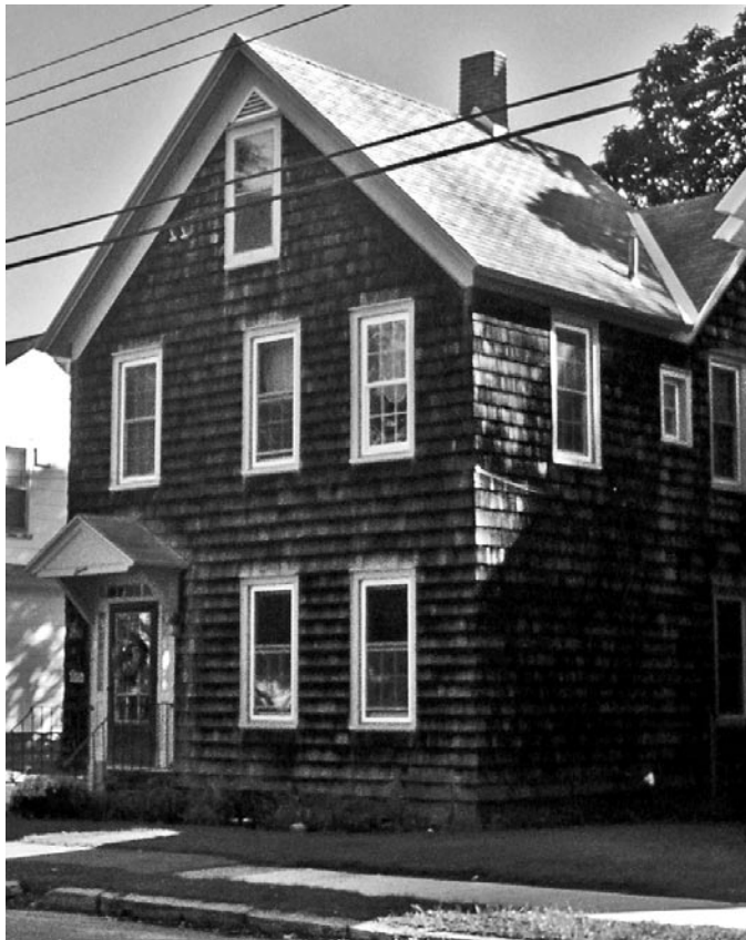
7 James Street, Scotia, NY