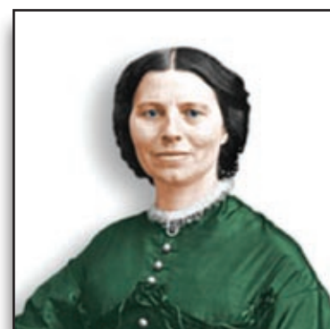
Clara Barton 1821-1912