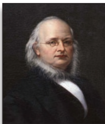
Horace Greeley 1811-1872