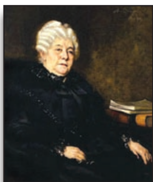
Elizabeth Cady Stanton 1815-1901