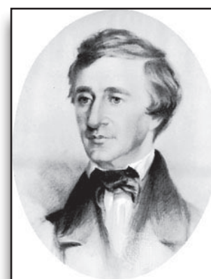
Henry David Thoreau 1817-1862

Famous 19th Century Visitors to Schenectady (who had something to say about the city)