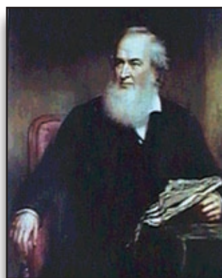
Gerrit Smith 1797 - 1874