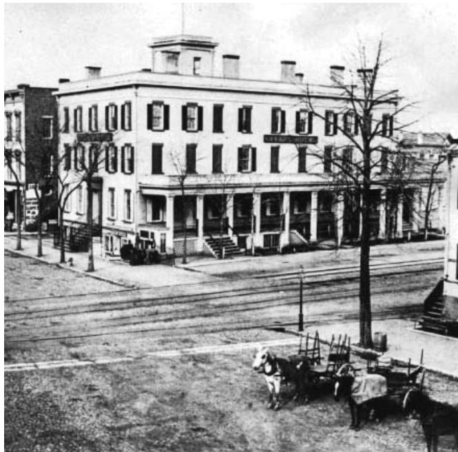
Given’s Hotel on corner of State and Wall.

“We were wild with delight as we drove down the Mohawk Valley, with its many bridges and ferry boats. When we reached Schenectady, the first city we had ever seen, we stopped to dine at the old Given’s Hotel, where we broke loose from all the