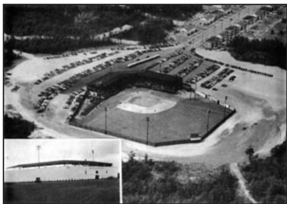
McNearney Stadium, circa 1947.