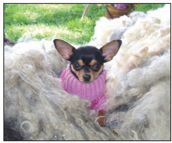
Ethyl – Mabee Farm mascot

FOR INFORMATION OR TICKET PRICES; 518-374-0263