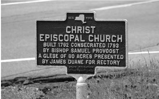
Road sign in Duanesburg for Christ Episcopal Church