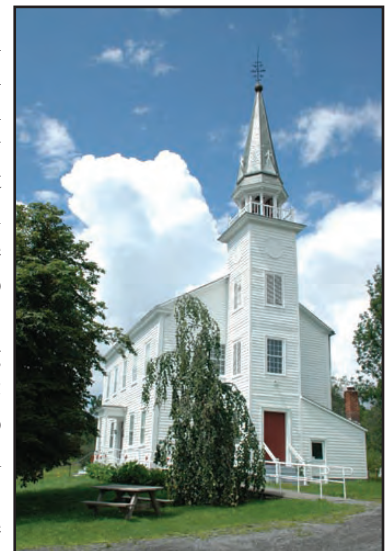
Christ Episcopal Church