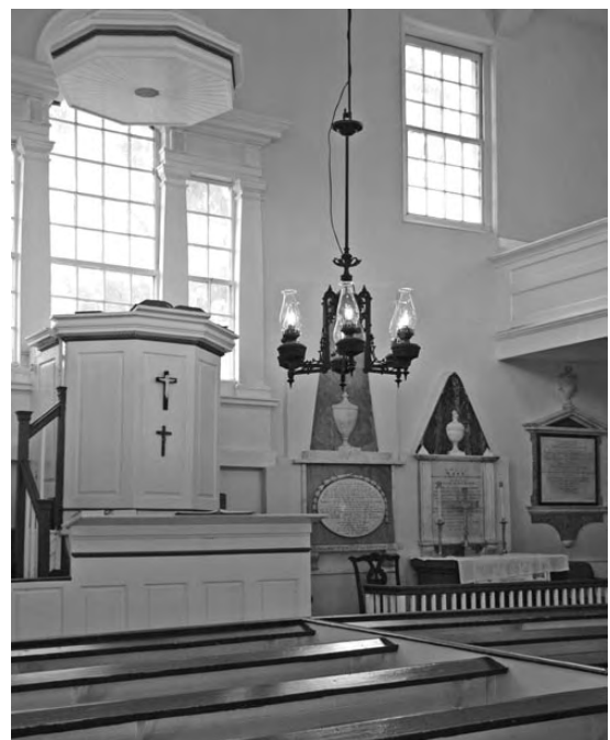
Interior of Christ Episcopal Church – burial crypts in right rear.

There was certainly no doubt about the importance of the role he played at the local, state, and national level by the people who knew him and they would have