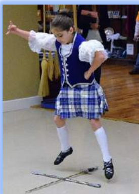
Braemar Highland Dancer