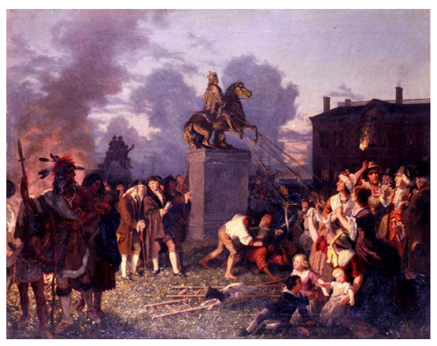
King George III plunges from his plinth in this romanticized version of the July 9, 1776 event in New York City.

the following approach. If we choose to memorialize a figure, we must first take a holistic look at their life and legacy. We shouldn't concern ourselves at all with the rank or position a character reached in their lifetime- being socially prominent and being good are two unrelated traits. Instead, we must weigh their virtues against their vices and their contributions against their failures. It's not a science and there can be no objective criteria for how to do this. But if after due deliberation we can agree this person helped bring about the type of change we want to see in the world, then they might deserve to be celebrated. Even then we should not fall into hero worship. The monument we erect in someone's honor must be specifically crafted to show why we're honoring them and should even acknowledge the things we find objectionable about them. For my money, that's what a constructive public engagement with history looks like.