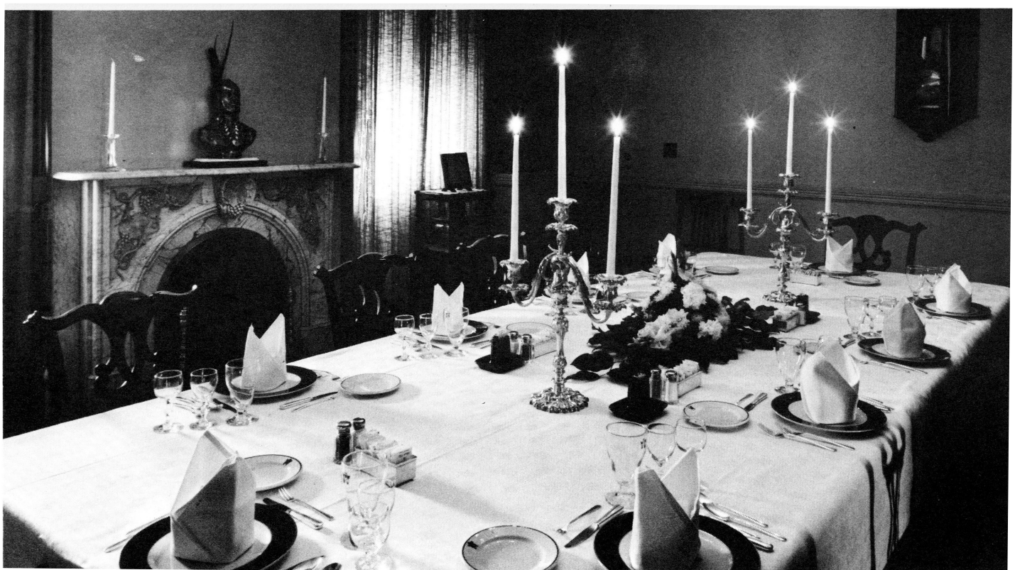
Page 1: A recent image of the Stockade Inn. Page 8: The Union Classical Institute c. 1905, from the Grems-Doolittle Library. Page 11 top: Postcard from the Wayne Tucker Postcard Collection at the Grems-Doolittle Library. Page 11 bottom: A private dining room inside the Mohawk Club, c. 1985, from the Grems-Doolittle Library.