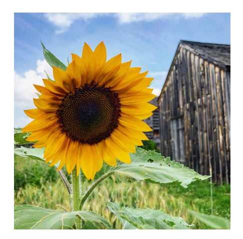
Gardens at Mabee Farm