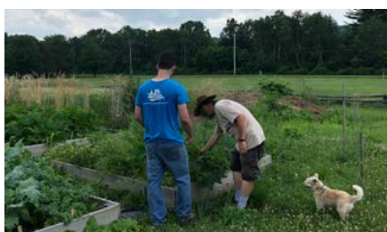
Staff tending to the Mabee Farm gardens.