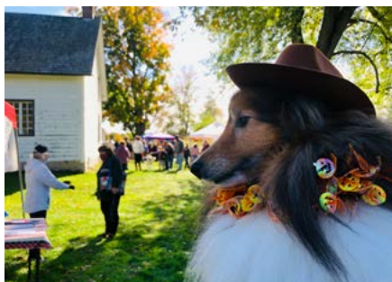
A friendly (and stylish!) dog attending the August Craft Market at Mabee Farm.