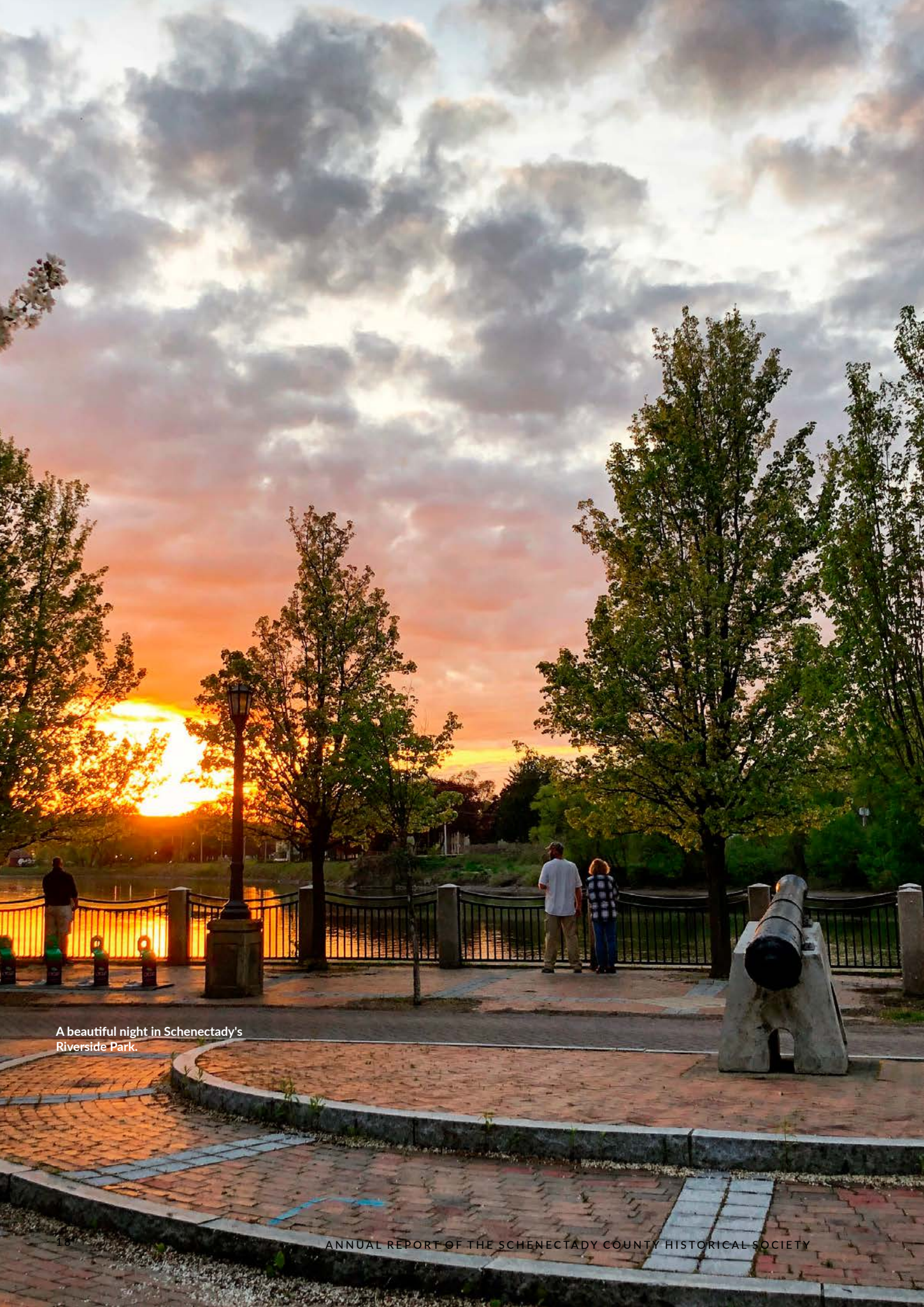
A beautiful night in Schenectady's Riverside Park.